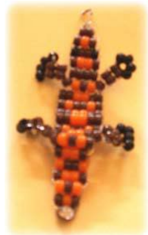
Striped Gila Monster